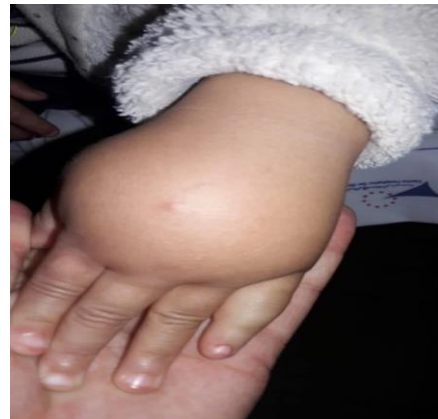
Fig 1: aspect of lymphedema of the left hand

splenomegaly, with the presence of lymphedema of the left hand (Figure 1). No jaundice, no edema, the urine dipstick is negative.